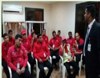
QZS - BIA

Toolbox Talk Trainings were conducted by Health & Safety officers to various Divisions: Quick Zebra Services, I Pest Control, Protect Security Services and Dream Readymix discussing topics regarding Work at Height, Manual Handling, Accident Reporting, etc.