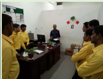
QZS – ENMA MALL