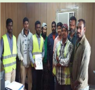
DREAM READY MIX